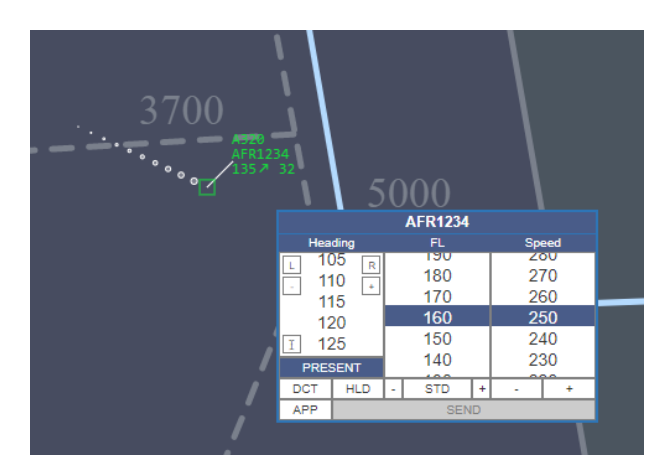
Figure 2: Flight level capture

Altitude or Flight Level (FL) clearances are issued by Air Traffic Controllers (ATCOs) to pilots. When a FL or altitude is given in a clearance to a pilot, the aircraft has to descend (or climb) to the given FL or altitude and maintain it when reached. An example of message issued by an ATCO is: Air France one two three four, climb level one six zero. Once this clearance is issued, ELSA checks its validity according to the aircraft flight envelope. Then if feasible, the clearance is issued to the flight guidance engine previously described. Figure 2 shows the multiple input window presented to the trainee for such a clearance.