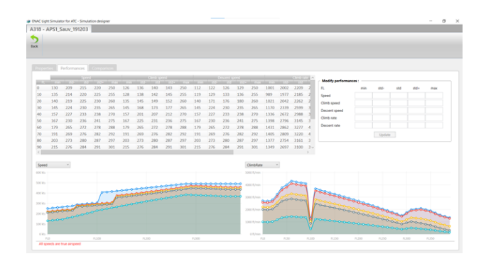
Figure 1: ELSA tabular performance data

tor, which enables the training designer to quickly create and view games or drills in an edit mode, and a simulation engine.