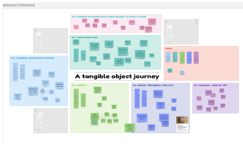
Figure 5. Screenshot of the miro board ( https://miro.com/app/board/uXjVPKM8Kil=/ ).

This theme received the least attention, which may hint at the difficulties the community has to reflect critically on its own impact on the environment. It may also hint at the fact the most critical scholars have left the community. Yet there is probably work to be done on understanding how to properly close and stop some activities [22], how to deal with the waste coming from IoT and other tangible interactive devices.