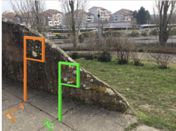
Figure 4. Situated visualization