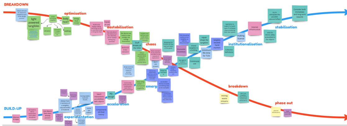
Figure 7. Analysis of ideas along breakdown and build-up X model curves.

This analysis raises questions regarding the status and timing of facts, explorations, methods, possibilities, etc that come to the mind when discussing sustainable TUIs. The two dimensions distinguish the status of the ideas: the ideas on the red curve are characterized as the current normal trying to survive by repairing itself, while the ideas on the blue curve represent a potential paradigm shift toward a new normal. The temporal dimension suggests the steps to be taken to move forward in the crisis.