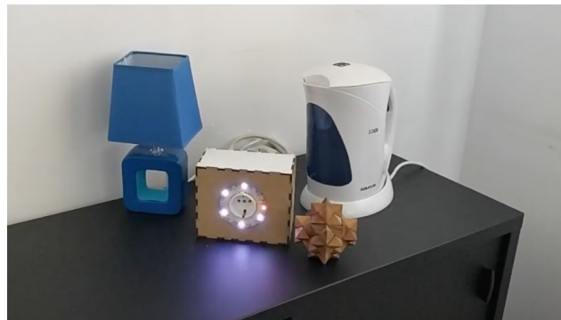
Figure 3. The fourth approach that emerged during the ETIS studio focused on users' decision making process using smart plugs as eco-feedback displays (e.g. [7]).

Another approach on eco-feedback described the latest insights into the ever topical issue of eco-feedback displays. Here, the work of Casado-Mansilla et al. [7] on smart plugs (see Fig. 3) highlighted how users are increasingly aware of such topics and expect more sophisticated features out of these devices. Examples include better models that describe that expected percentage of renewables in the grid at any given time (e.g., [25]); advanced information visualizations to better help users monitor, plan, and assess the source of the energy they consume; automation instead of voice controls or direct manual input; connection to other smart devices that provide, for instance, water consumption information; or remote access and customizable dashboards. The latter is well known in sustainable HCI [13], and still seems to resonate with users in 2023. But while various users reported on a wide range of ideas for future iterations of eco-feedback displays, others reported wanting less functionality and dependencies, for a simpler UX. This conflict has been highlighted before [16], and might explain the lack of mainstream adoption of more general home energy management systems (HEMS).