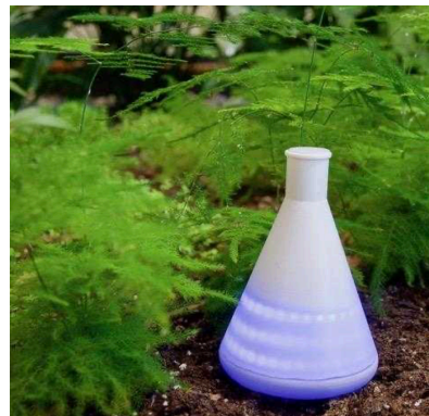
Figure 2. With Erlen , the consumption of the electrical devices you use daily accumulates in a tangible object that you need to empty time to time

In another discussion, the question was about the concrete impact of tangible approaches for encouraging industrial degrowth, and pro-environmental behaviors in general. Indeed, many intuitions make us think that tangible interfaces may play a positive role for achieving these objectives. In particular, tangible interaction may stimulate engaging user experiences that can lead to virtuous actions. As an example Erlen illustrated in Figure 2 is a project whose goal is to help users reduce their personal electrical consumption by involving them in a tangible task. Such interfaces can be evaluated in terms of usability, attractiveness, or induced emotions for example. These are indicators that can inform us about the potential of such or such interfaces. On the other hand, their concrete impact on behavior change is still an open research question. Collaborations with experts in behavioral sciences seem to be a promising research direction.