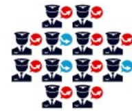
CLASSIFICATION BY EXPERT PILOTS