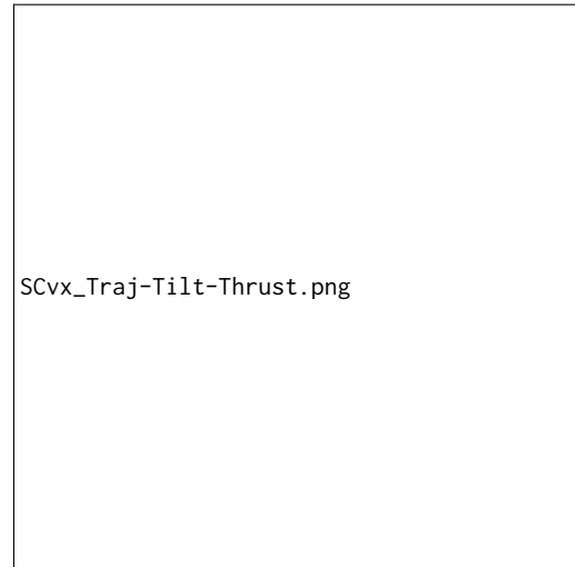
Figure 2: Converged trajectory and thrust profile. Feasibility in physical space and in terms of temporal requirement is validated.

Figure 3 shows the robust measures of \rho^{\varphi_1} and \rho^{\varphi_2} . One can easily see that \rho^{\varphi_1} holds Until \rho^{\varphi_2} holds, which verifies the temporal requirement \rho^{\varphi_1} \mathcal{U}_{[a,b]} \varphi_2(x, t_0) \geq 0 for this experiment.