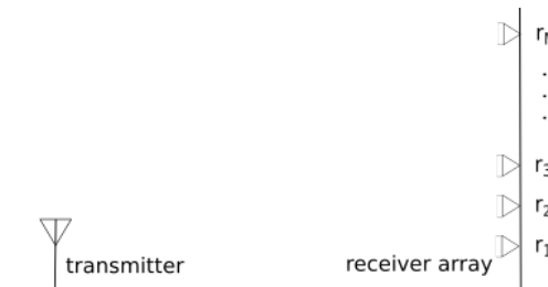
Figure 1. Schematic of bistatic configuration.

This formulation is extended to the use of wide-angle approximation of PE (WAPE), which is more accurate than NAPE and solved with the method of split-step wavelet (SSW) [4], which is less computationally costly than SSF. In this paper, the validation of our method is presented.