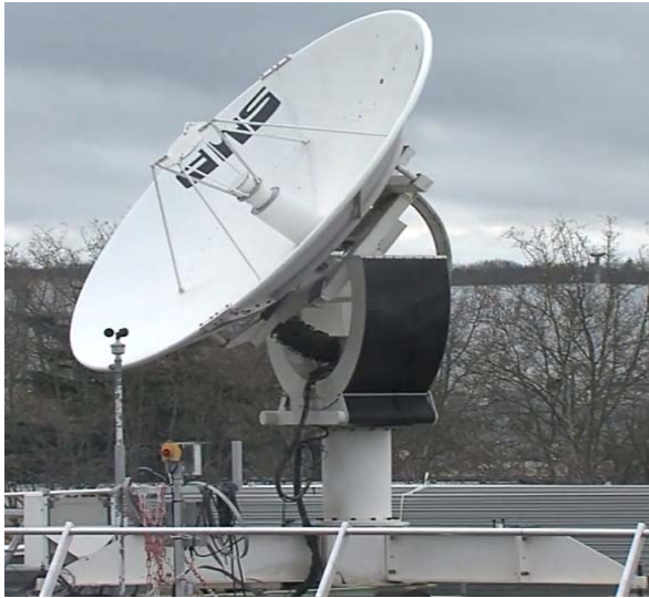
Figure 1: TETX Antenna

band receiving ground station, providing access to high data rates, should trigger new nanosatellites project with more demanding, but also promising, missions.