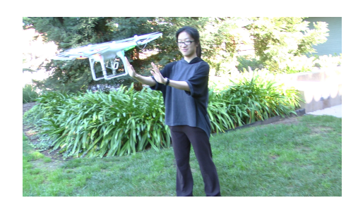
Figure 1: Gestural input with drones [3].