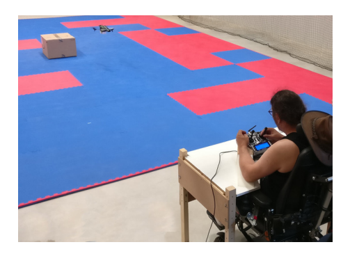
Figure 4: Making HDI accessible to people with impairments.

strategies, automation, control, trust, as well as privacy and ethical issues in HDI research. These topics are relevant to ensure the successful integration of the technology.