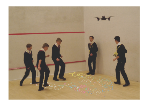
Figure 3: Interactive games with drones [10].