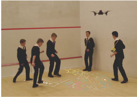
Figure 3: Interactive games with drones [10].