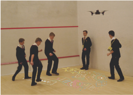
Figure 3: Interactive games with drones [10].