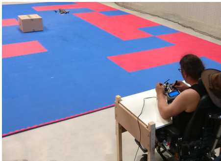
Figure 4: Making HDI accessible to people with impairments.