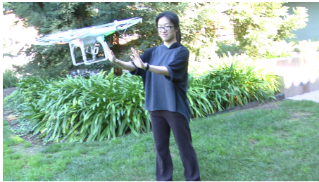
Figure 1: Gestural input with drones [3].