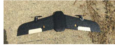
Figure 3 ENAC's "Dark Knight" drone

The results obtained are currently being used to design the data fusion algorithm.