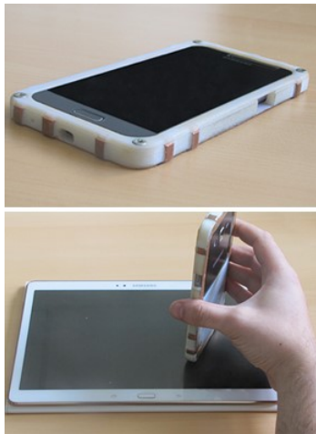
Figure 3: Copper-based case (top). Stacking of our prototype on the tablet screen (bottom).

The Finger Stack is a bimanual technique that consists in defining the top-left corner of the cell range with a finger touch (Figure 6 – Left) and the bottom-right corner with the smartphone stack (Figure 6 – Right). The bottom-right corner is selected using the red dot feedback as in the Stack-and-Drag technique. The two corner cells positions can be adjusted with a finger drag and/or a translation of the smartphone.