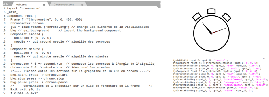
Fig. 2. SMALA code, DJNN/C generated code, and execution result

SMALA code for a chronometer is shown on Fig. 2 with an extract of generated code (C). Here, we load an SVG file containing graphical elements of the chronometer, that are associated to dataflow elements. For instance, the graphical representation of the needle for the seconds is loaded from the SVG file, and composed with a rotation component. Then, the rotation angle is bound with the property containing the value of seconds from the chronometer. Thus, each time the value will vary, the needle will be redrawn with the corresponding angle.