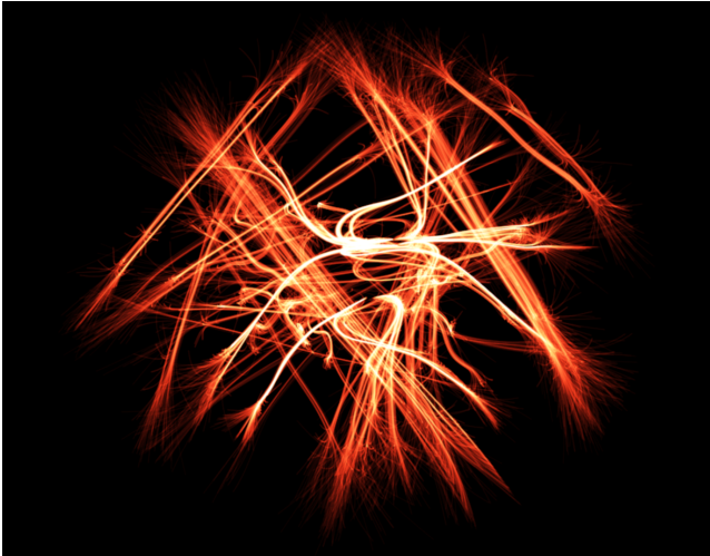
Figure 2: This image shows air traffic visualization with edge bundling simplification technique [HPNT18].