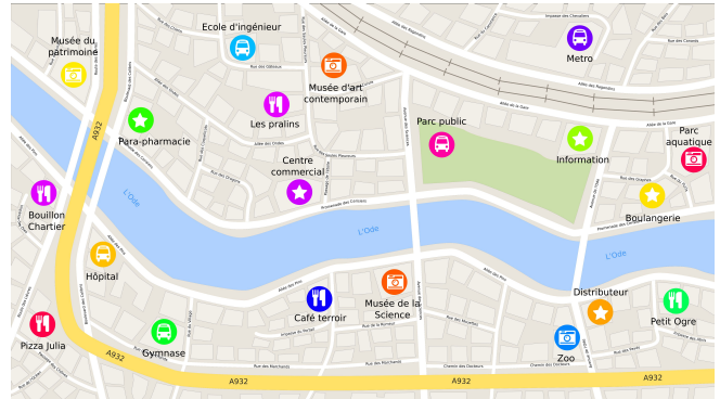
Figure 3. Map M2 (European-style map) used in the Indoor Study for Task 3, counter-balanced with M1

The study compared the usability of the Tactile and Spatial techniques when interacting with a floor-projected map. As