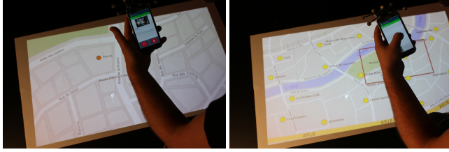
Figure 2. FlyMap Indoor Prototype (Left) the phone is used as controller, with additional details about Points of Interest displayed on the screen. (Right) the phone's touch screen is used to control the map.