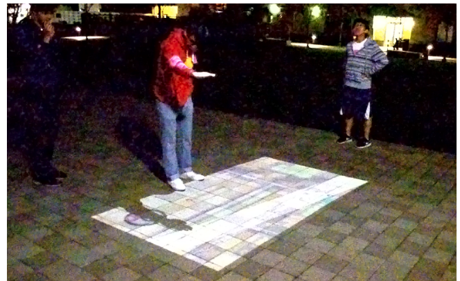
Figure 1. FlyMap in use in a tour guide context at Stanford University by a visitor defining what route to take using mid-air gestures.

done in the past decades to improve human-robot interaction. Yet, these interaction principles cannot simply be translated into flying robots (a.k.a drones).