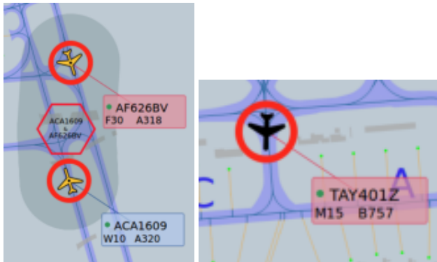
Figure 3: Conflict and Warning representations.

ACA1609 is going straight ahead and neither of them has been told to give way to the other. On the right, TAY401Z is circled in red to alert the ATCO that it has stopped for more than 10 seconds. The ATCO must determine if the aircraft has broken down, momentarily paused, or requires transfer to the next sector.