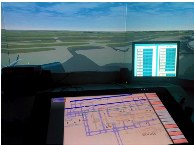
Figure 4: MoTa platform in the ATC simulator at ENAC, from the perspective of the user.

The Project MoTa validation campaign consisted of evaluating the platform at different stages under a range of work scenario difficulties in order to understand the impact of such technologies on ATCO performance and workload. Three human-in-the-loop experiments were conducted during the course of almost two years, each centered on a specific technology level, with both scenarios simulated in each experiment. All experiments were conducted in the ATC simulator of the Aeronautical Human-Computer Interaction Laboratory at Ecole Nationale de l'Aviation Civile (ENAC; Toulouse, France; Figure 4). The platform simulates the ground controller position at CDG. In brief (for details, please refer to [6]), there are three pseudopilots to displace aircraft around the airport with respect to ATCO commands. A 225 deg external view from the tower is provided to the participant.