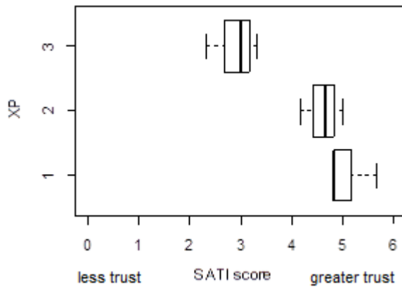
Figure 7: Changes in SATI score due to Technology Level (XP)

usage of the interface was interacting with the path suggestion and decision support system elements of the interface, either for aircraft equipped with or without Datalink. The main difference between the two types of aircraft was simply a question of whether commands could be transmitted via interface or needed to be communicated via radio. In general, participants found the path suggestion useful, but limited in its ability to adapt to non-standard paths. The modification of trajectories posed significant problems to participants, particularly in engaging the manual mode and creating the modification.