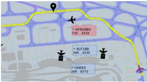
Figure 2: Standard route modification using waypoints.