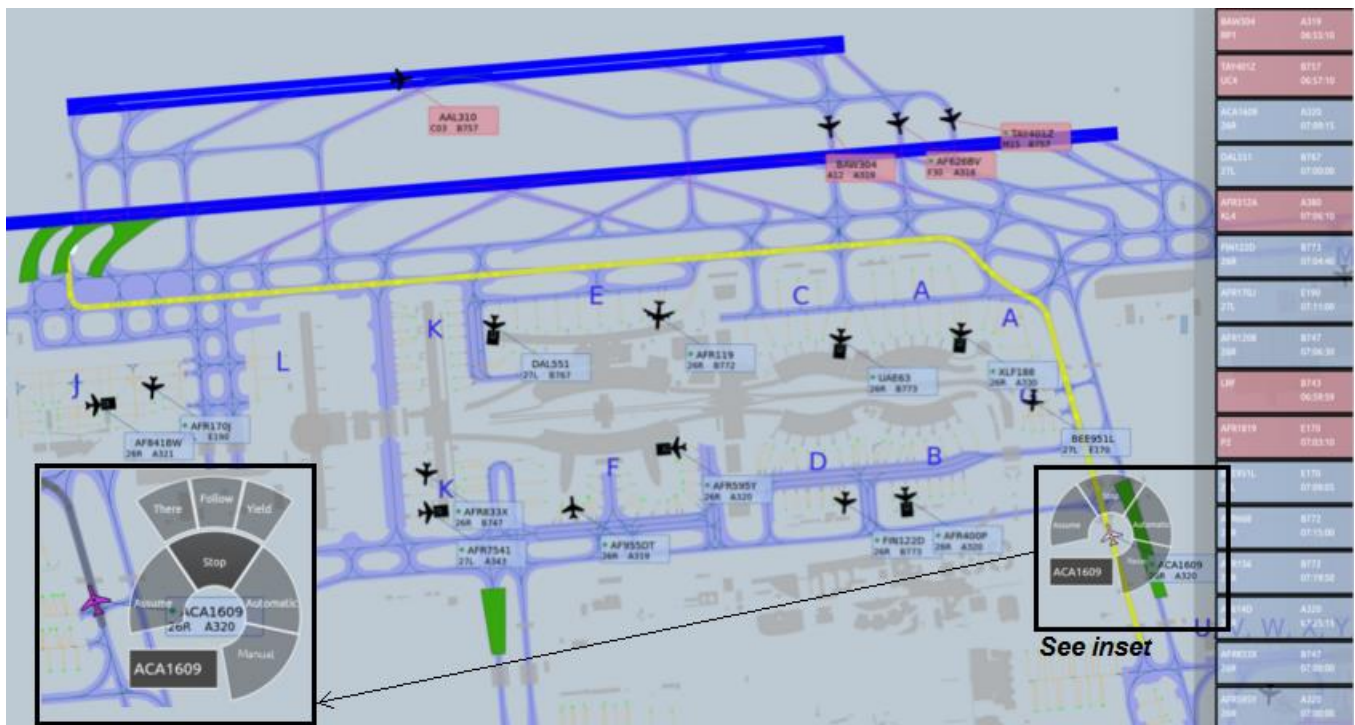
Figure 1: MoTa ground controller interface prototype, as in use for the South ground sector at CDG. The right panel is a list of all aircraft with information regarding their CTOT or arrival time and their flight status. The areas in green are potential holding points where the ATCO could send the aircraft. The physical location of the aircraft are represented by icons (those with a rectangle represent aircraft towed by an autonomous tug)

reached the end of its clearance and advise the ATCO to transfer this aircraft so that the trajectory is continuous. An interface such as this is a natural fit for technologies such as Datalink, which was also evaluated in this project. Currently Datalink on ground is not frequently used (except for engine start-up authorization), but in the near future it could be expanded especially for lengthy, non-urgent instructions.