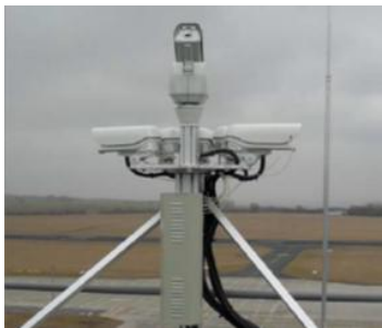
Figure 2: Mast with cameras for the Remote Tower concept.

Lowering costs: the RT project aims primarily to reduce operating costs and maintenance of small airfields. When the traffic density of an airfield is low, it is not profitable to maintain a control tower and its associated infrastructure.