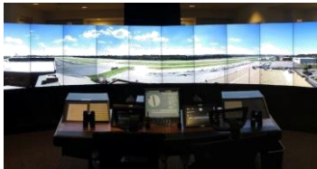
Figure 1: Typical Remote Tower room.

To maintain and improve safety and efficiency in ATC, the service providers need to constantly innovate with new systems and devices. The Remote Tower (RT) concept belongs to one of the most recent innovations [12]. The RT (Figure 1) fulfills ATC services from a location remote from the original control tower. A mast is deployed on the airfield with various sensors (cameras, radio antenna, etc.) and a video stream with additional information is transmitted to a remote site thanks to network communication systems. Many countries have started developing RTs to lower the building costs compared to actual tower and to provide ATC services in low-traffic or difficult-to-access aerodromes. In order to better understand the RT challenges, we summarize in the following the design requirements of this concept: