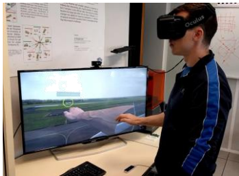
Figure 3: The immersive environment for the Remote Tower concept.

use thermal/infrared vision with virtual labels. Due to the low visibility, the ATCo turns on thermal vision to enhance the monitoring. This enables the controller to view the aircraft that is waiting at the holding point and the aircraft on final approach. The ATCo can additionally see the information displayed in the virtual labels that are linked to the aircraft. When the aircraft has landed and the ATCo confirms by the position of the labels that the landing was successful and it has passed the waiting aircraft, clearance for the waiting aircraft to line up on the runway is given. As the aircraft starts moving, the ATCo receives feedback of the action on the label. The thermal/infrared vision allows the controller to see when the runway is vacated and can give take-off clearance with no delay. Having thermal/infrared vision and virtual labels in a control tower can increase the ATCo's situational awareness, especially in low visibility. It is also beneficial for safety and efficiency concerns. However, if there are several aircraft near each other, the amount of labels could confuse the controller and cause dangerous situations.