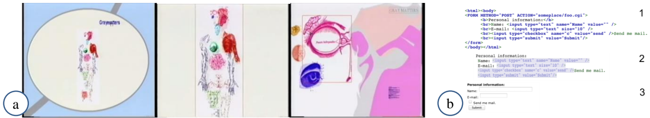
Figure 1 – Illustration of (a) Role 1: ZUIs support infinite pan and zoom in an information space with animation ; (b) Role 2: Glimpse [15] animates between markup code (i.e., HTML) and the rendered document .