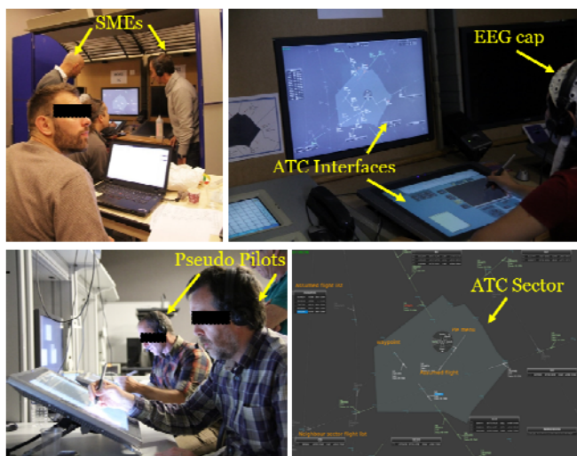
Figure 1. Experimental setup: prototypal ATCO working positions developed by ENAC (Toulouse, France) for a research simulator. The ATCO's brain activity has been recorded continuously and S, R and K events have been marked in order to recognize them within the entire EEG recording.

ATCOs have been asked to perform an ATM simulation using the research simulator hosted at ENAC (Figure 1). The ATM scenario included three levels of difficulty, easy, medium, hard, and lasted 45 minutes. The same experiment was also used to validate a EEG based workload index [13]. The traffic complexity has been modulated by the number of aircraft in the controlled sector and the geometry of conflicts. Six S-R-K events (two for each type, S1, R1, K1, S2, R2, K2) have been inserted into the ATM scenario within coherent difficulty conditions (Figure 2). The S-R-K events have been designed to maximise the realism of ATC tasks (see the following section for more details). The system was calibrated recording ATCOs' brain activity in a Baseline condition (rest conditions, with closed and open eyes) and in a Reference condition (ATCOs looked at the radar screen without reacting,