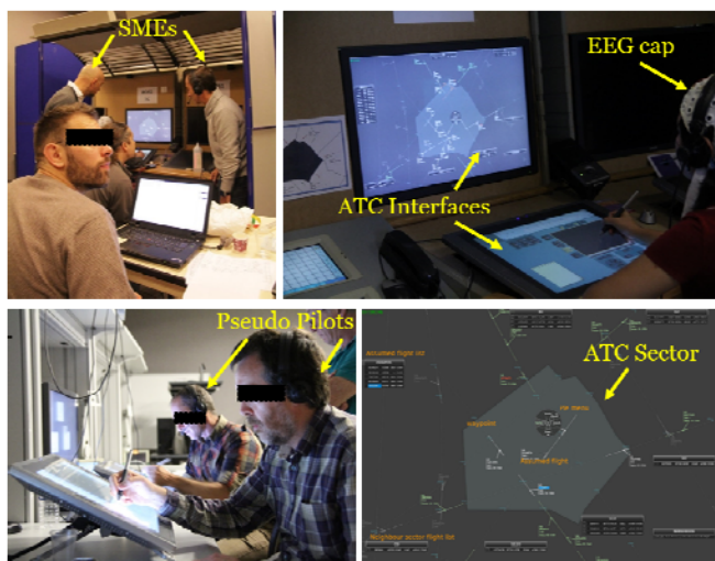
Figure 1. Experimental setup: prototypal ATCO working positions developed by ENAC (Toulouse, France) for a research simulator. The ATCO's brain activity has been recorded continuously and S, R and K events have been marked in order to recognize them within the entire EEG recording.

ATCOs have been asked to perform an ATM simulation using the research simulator hosted at ENAC (Figure 1). The ATM scenario included three levels of difficulty, easy, medium, hard, and lasted 45 minutes. The same experiment was also used to validate a EEG based workload index [13]. The traffic complexity has been modulated by the number of aircraft in the controlled sector and the geometry of conflicts. Six S-R-K events (two for each type, S1, R1, K1, S2, R2, K2) have been inserted into the ATM scenario within coherent difficulty conditions (Figure 2). The S-R-K events have been designed to maximise the realism of ATC tasks (see the following section for more details). The system was calibrated recording ATCOs' brain activity in a Baseline condition (rest conditions, with closed and open eyes) and in a Reference condition (ATCOs looked at the radar screen without reacting,