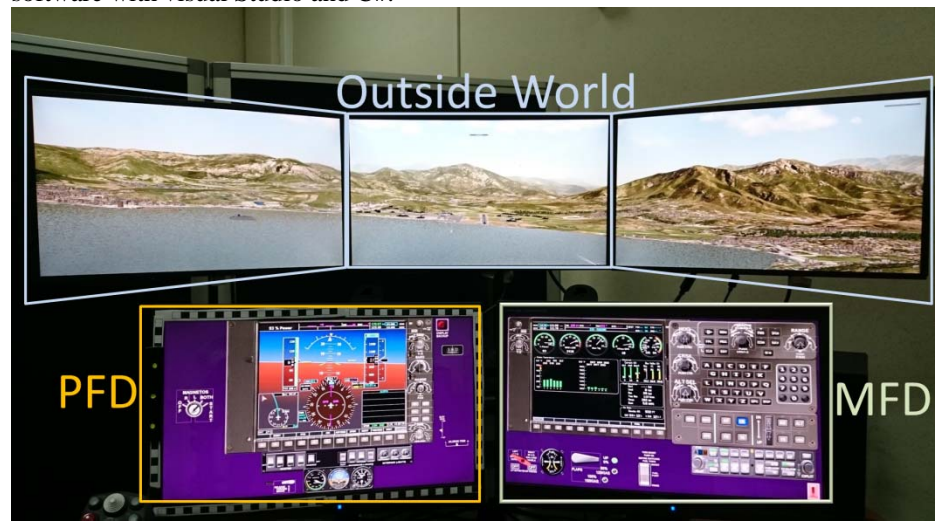
Fig. 1. Cirrus Perspective with Garmin 1000 simulator environment (CReA)

solution with an accuracy of 0.3^{\circ} at 50hz. We computed the head movement and the gaze correction with a third computer: Core i7 2.2gh, 8Go ram. We developed our software with visual Studio and C#.