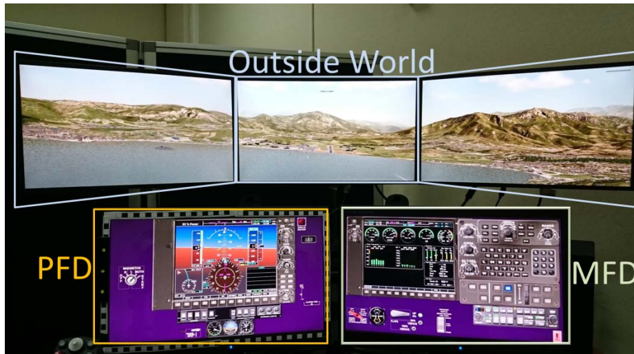
Fig. 1. Cirrus Perspective with Garmin 1000 simulator environment (CReA)

solution with an accuracy of 0.3^\circ at 50hz. We computed the head movement and the gaze correction with a third computer: Core i7 2.2gh, 8Go ram. We developed our software with visual Studio and C#.