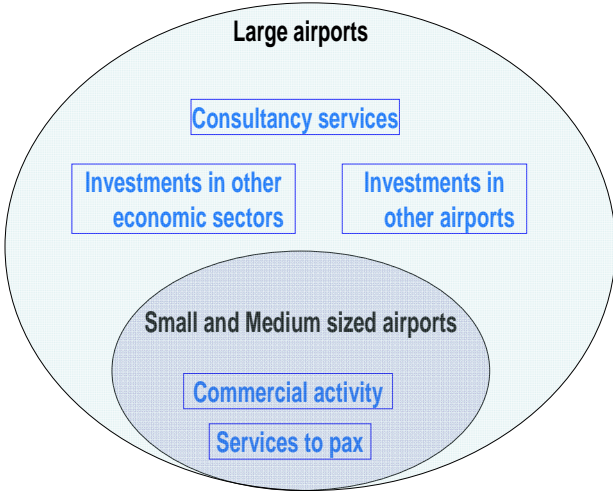
Figure 2: Strategies of diversification by airport size