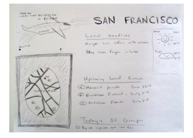
Figure 1: Paper prototype for booking a flight.

Users also reported a great diversity of situations, such as ripping and burning CDs , connecting to Wifi , syncing a phone , streaming web content , doing a backup , booking a flight , rendering video and logging off , although those situations were each reported only once.