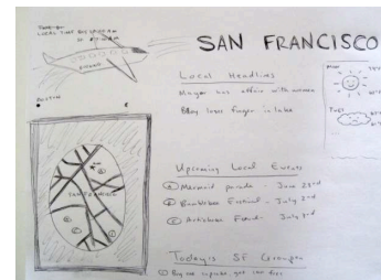
Figure 1: Paper prototype for booking a flight.

Users also reported a great diversity of situations, such as ripping and burning CDs , connecting to Wifi , syncing a phone , streaming web content , doing a backup , booking a flight , rendering video and logging off , although those situations were each reported only once.