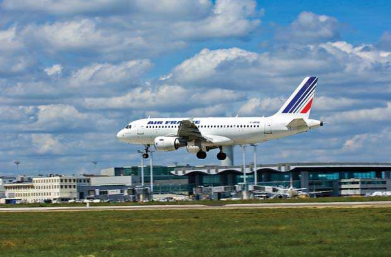
Aéroport de Bordeaux-Mérignac

One would think “infrastructure efficiency” would also be important to small airport, because of the small yields