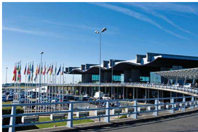
Aéroport de Bordeaux-Mérignac

The relevance of the results of the FAST study was confirmed by the Bordeaux airport strategy. In June 2009, three months after the end of the FAST project, Bordeaux Mérignac airport decided to build a low-cost terminal, which will be opened in May 2010. This strategy is fully in line with the FAST results for Bordeaux airport: attracting additional low-cost and securing the loyalty of passengers in contemplation of the future strong competition with the high-speed train in 2016.