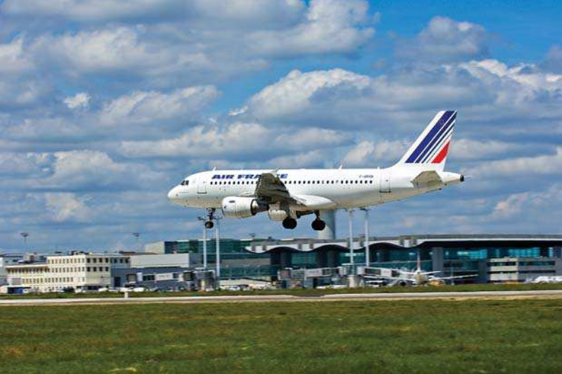
Aéroport de Bordeaux-Mérignac

One would think “infrastructure efficiency” would also be important to small airport, because of the small yields