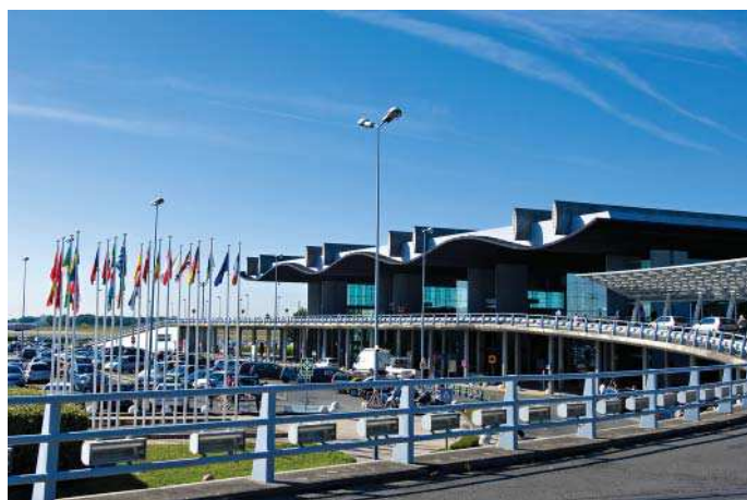
Aéroport de Bordeaux-Mérignac

The relevance of the results of the FAST study was confirmed by the Bordeaux airport strategy. In June 2009, three months after the end of the FAST project, Bordeaux Mérignac airport decided to build a low-cost terminal, which will be opened in May 2010. This strategy is fully in line with the FAST results for Bordeaux airport: attracting additional low-cost and securing the loyalty of passengers in contemplation of the future strong competition with the high-speed train in 2016.