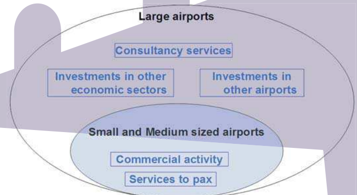
Figure III 2: Strategies of diversification by airport size