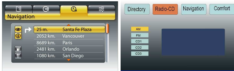
Fig. 2. a. With one graphics file