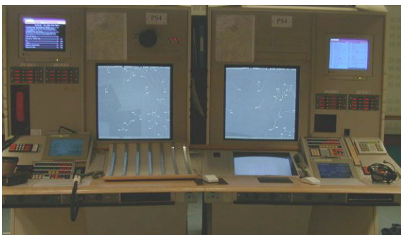
Figure 1: ODS control position

This control position is clearly designed for two controllers with specific activities and roles. The tactic controller (on the left), is in charge of contacting aircrafts, attributing clearances, managing guidance and separations, resolving conflicts and transferring aircrafts to other sectors. His/her main tools are the paper strip board, the radar display and the radio. The planner controller (on the right) is in charge of inter-sector coordinations, integration of new strips and pre-analysis to help the tactic controller. His/her tools are the strip board, the telephone and the radar display.