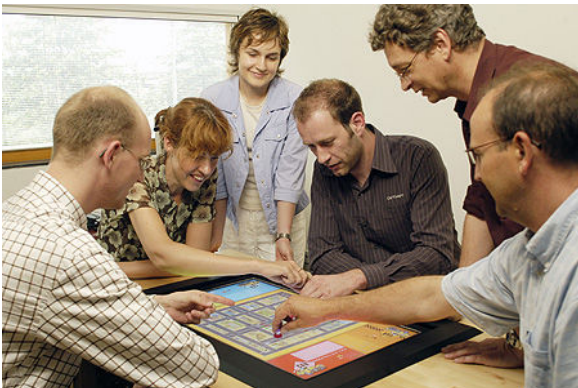
Figure 2: Philips Entertaible

Recent technological advances in user input tracking have enabled the construction of interactive tables that can now be commercialized. They enable the detection and tracking of multiple points of input, including complex shapes such as hand profiles, from multiple users simultaneously.