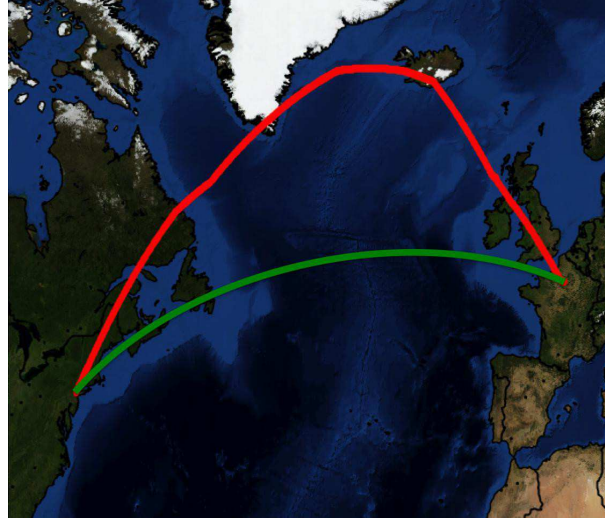
Fig. 2. Difference between the shortest path trajectory (green) and the real trajectory (red) for a Paris-New York flight on the 16 th of September 2011.

Methodology. In order to avoid this bias, our study is based on the replay of real traffic traces from the French civil aviation authority and Eurocontrol based on either radar data or position report from the aircraft itself. If a time-scale smaller than the one provided by the reports is required, intermediate positions are interpolated between these reported positions. In the rest of this paper, we will refer to these as “pseudo-real” positions.