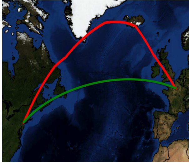
Fig. 2. Difference between the shortest path trajectory (green) and the real trajectory (red) for a Paris-New York flight on the 16 th of September 2011.

Methodology. In order to avoid this bias, our study is based on the replay of real traffic traces from the French civil aviation authority and Eurocontrol based on either radar data or position report from the aircraft itself. If a time-scale smaller than the one provided by the reports is required, intermediate positions are interpolated between these reported positions. In the rest of this paper, we will refer to these as “pseudo-real” positions.