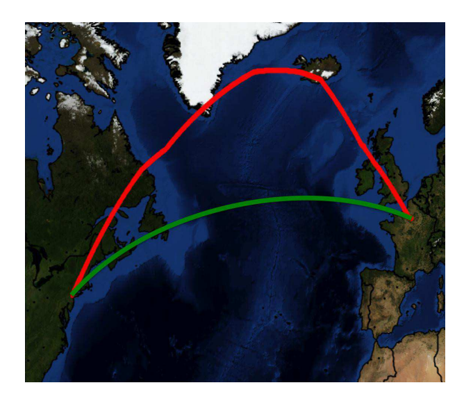
Fig. 2. Difference between the shortest path trajectory (green) and the real trajectory (red) for a Paris-New York flight on the 16<sup>th</sup> of September 2011.

Methodology. In order to avoid this bias, our study is based on the replay of real traffic traces from the French civil aviation authority and Eurocontrol based on either radar data or position report from the aircraft itself. If a time-scale smaller than the one provided by the reports is required, intermediate positions are interpolated between these reported positions. In the rest of this paper, we will refer to these as "pseudo-real" positions.