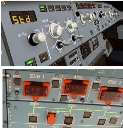
Figure 3 : (top) Airbus FCU physical buttons (Flight Control Unit); (bottom) overhead panel: guarded buttons.

R.C.5. Degraded context. In the cockpit, both environmental and cognitive factors can dramatically degrade the performance of human operators. For example, extreme lighting conditions, vibrations or degraded flying conditions (weather, aircraft failure), but also cognitive overload (fatigue, stress, time pressure), might greatly downgrade efficiency. This requires to include adapted interactive solutions, i.e. efficient in degraded contexts, from the start of the design process.