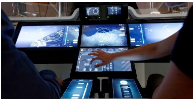
Figure 2 : Avionic 2020 tactile screens.