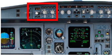
Figure 1. a) Navigation and flight displays in the cockpit of a TB20; b) buttons of the EFIS (Electronic Flight Instrument System) control panel that control the display mode of the navigation display (ND) (2 nd from the left).