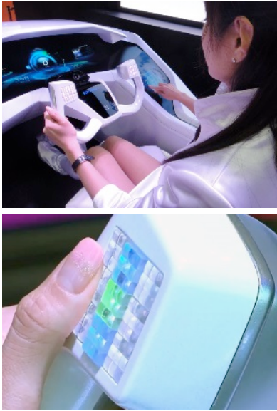
Figure 4 : Mitsubishi Emirai cockpit concept